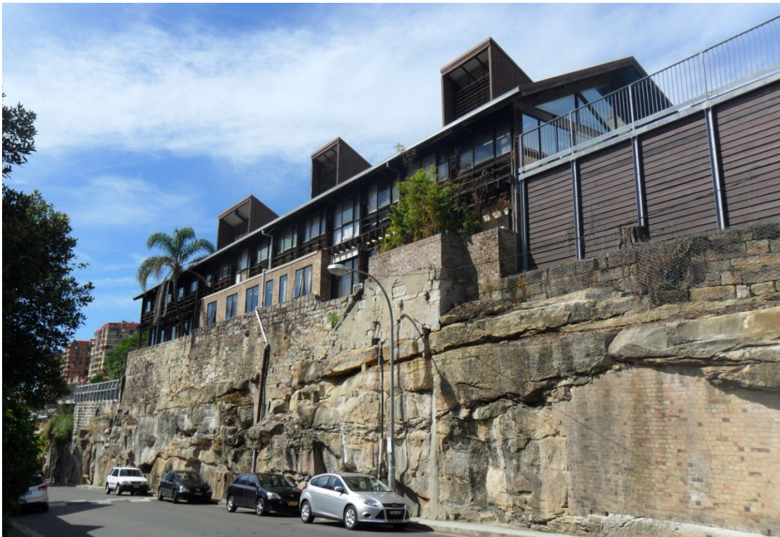
Figure 1: Calidad Building at 163 Brougham Street, Woolloomooloo, as viewed from McElhone Street