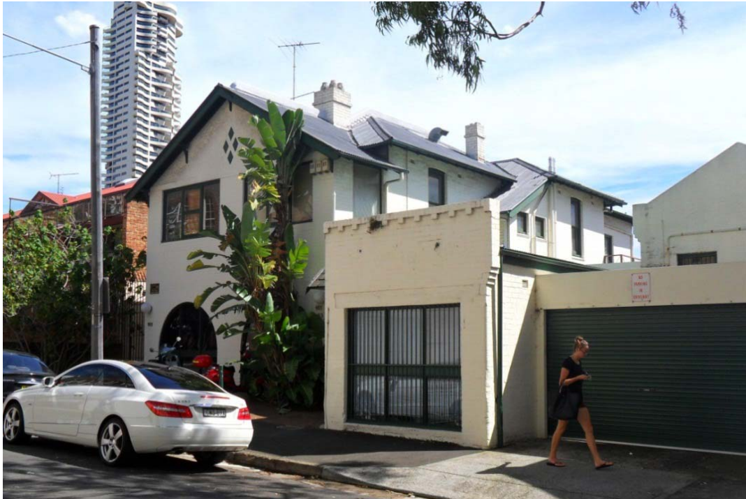
Figure 3: Brougham Street view of assessed pair of semi-detached Federation houses at 153-165 Brougham Street, Woolloomooloo